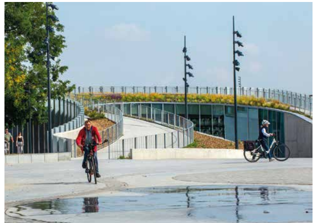
THE NID