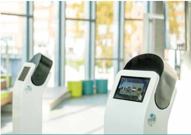
THE NID - VIRTUAL REALITY TERMINALS © S. ROBERTY