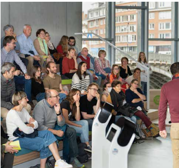
THE NID - SPACE FOR DEBATES

This space is dedicated to debates, exchanges of ideas, etc. It invites the stakeholders of the city to meet each other and discuss the issues raised at the NID.