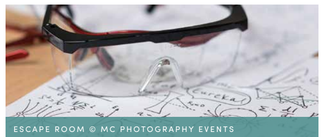
ESCAPE ROOM

Public: 15 years and above - Duration: 1 hour Language: french