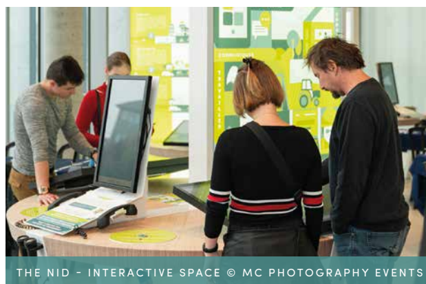
THE NID - INTERACTIVE SPACE

Through a simulation game, you will develop the infrastructure necessary for the proper functioning of a city (supermarket, roads, public transport networks, recycling park, etc.).