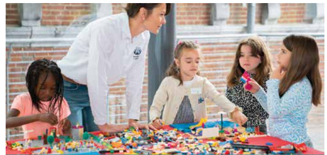
BUILD YOUR CITY OF TOMORROW

Public: children between 6 and 12 years of age Duration: ½ day - Language: french